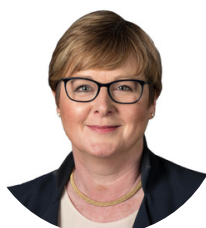
Senator the Hon. Linda Reynolds CSC, Minister for the National Disability Insurance Scheme, Minister for Government Services

After eight years of the NDIS, the Scheme is starting to mature following early investment in building independence and inclusion. As we look to the future, my focus will be on working with the sector and participants to co-design improved NDIA systems and processes, deliver more consistent decision-making and ensure participants have the right funding in place. The NDIS will continue to grow and evolve, but it is a scheme that all Australians can be proud of, and I look forward to working with you to make the NDIS even more successful.